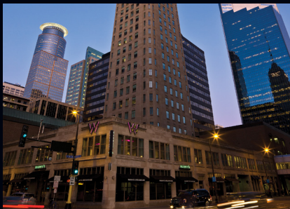
W Minneapolis - The Foshay Minneapolis, Minnesota