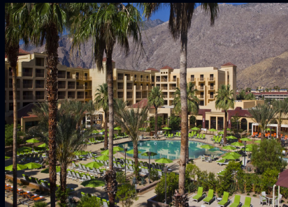
Renaissance Palm Springs Palm Springs, California