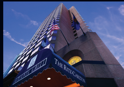
Ritz-Carlton Atlanta Atlanta, Georgia