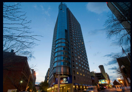
Hilton Boston Back Bay Boston, Massachusetts