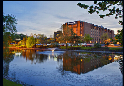
Hilton Parsippany Parsippany, New Jersey