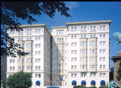
The Churchill Washington, District of Columbia