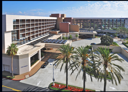
Hilton Costa Mesa Costa Mesa, California