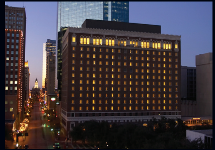
Hilton Fort Worth Fort Worth, Texas