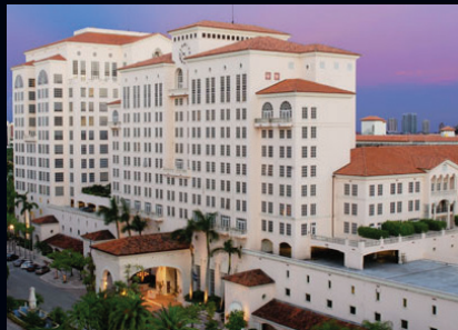
Hyatt Regency Coral Gables Coral Gables, Florida