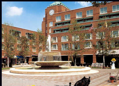
Westin Princeton Princeton, New Jersey