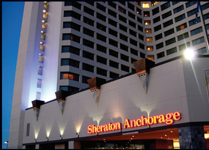
Sheraton Anchorage Anchorage, Alaska