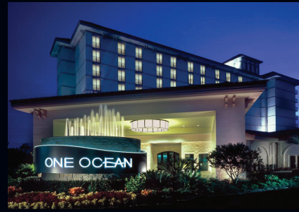
One Ocean Atlantic Beach, Florida