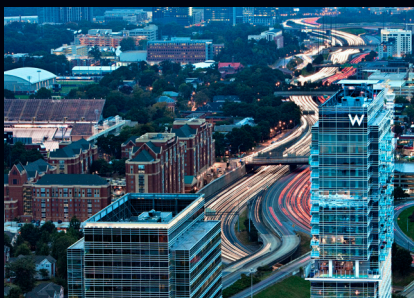
W Atlanta - Downtown Atlanta, Georgia