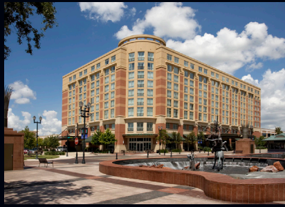
Marriott Sugar Land Houston, Texas