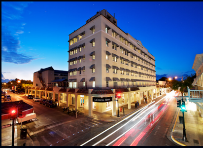
Crowne Plaza Key West Key West, Florida