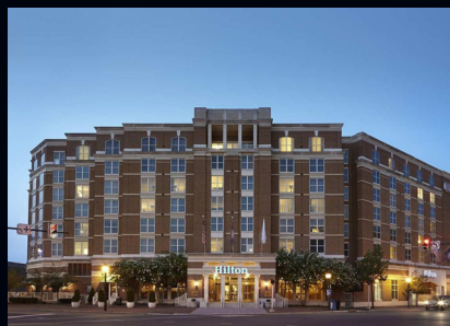
Hilton Alexandria Old Town Alexandria, Virginia