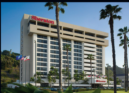
Sheraton San Diego Mission Valley San Diego, California