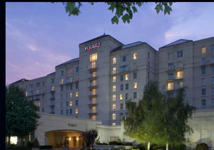
Hyatt Regency Long Island Hauppauge, New York