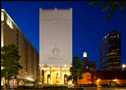
Le Pavillon New Orleans, Louisiana