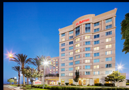
Fremont Marriott Silicon Valley Fremont, California