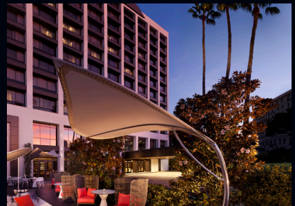
Marriott Beverly Hills Beverly Hills, California