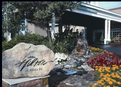
Hilton Santa Fe Santa Fe, New Mexico