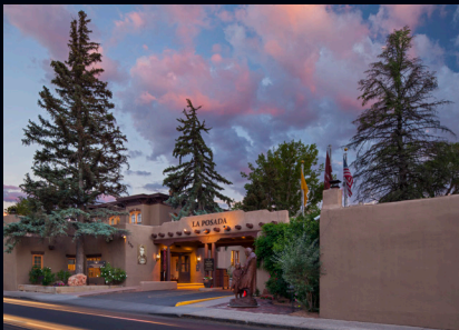
La Posada de Santa Fe Santa Fe, New Mexico