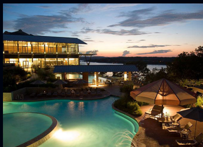
Lakeway Resort and Spa Austin, Texas