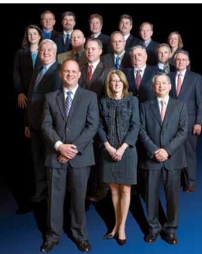
Senior Management Team

These improvements and realignment activities, in addition to the work that we have done over the last several years on rebalancing and