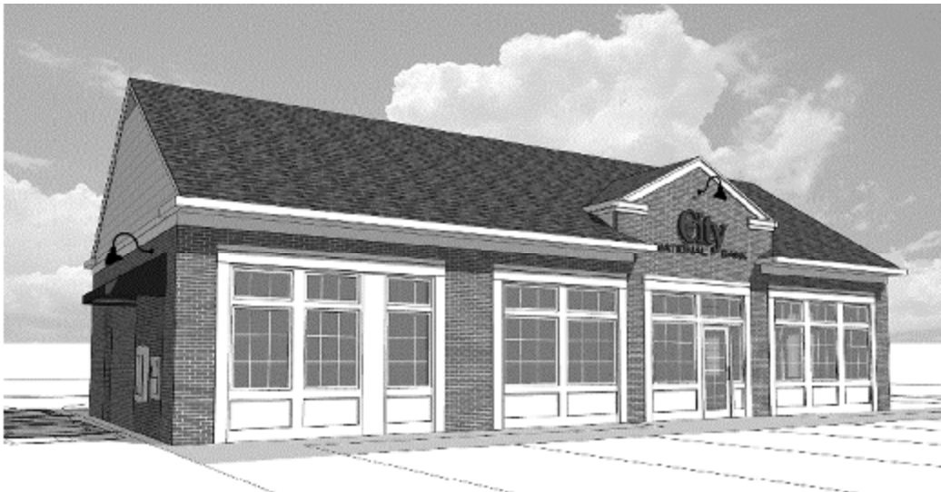
Rendition of the Company's Worthington branch.

In September 2018, the Company opened a new branch office in Morgantown, West Virginia. In December 2018, the Company opened a new branch office in the Columbus suburb of Worthington, Ohio.