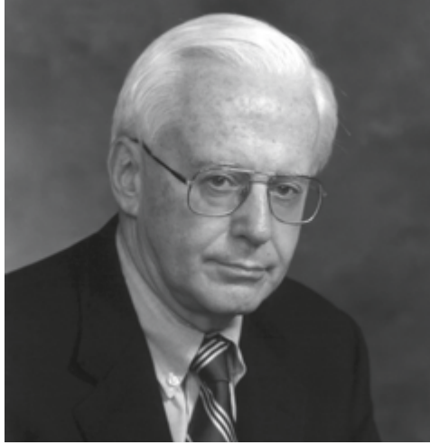
Franklin M. Fisher, Chairman Emeritus