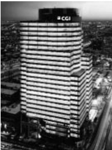
In 2003, thousands of CGI's Montreal members moved into the Company's new e-Commerce Place premises.

For a list of CGI offices worldwide, please visit our Web site at www.cgi.com .