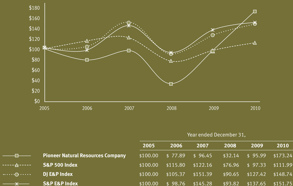
COMPARISON OF FIVE-YEAR CUMULATIVE TOTAL RETURN AMONG PIONEER, THE S&P 500 INDEX, THE S&P E&P INDEX AND THE DJ E&P INDEX a

The following graph and chart compare Pioneer’s cumulative total stockholder return on common stock during the five-year period ended December 31, 2010, with cumulative total return during the same period for the Standard & Poor’s 500 Index (“S&P 500 Index”) and the Standard & Poor’s Oil & Gas Exploration & Production Index (the “S&P E&P Index”). The graph and chart also reflect cumulative total return for the same period for the Dow Jones U.S. Exploration and Production Index (“DJ E&P Index”), the industry index presented in the stock performance table in Pioneer’s 2009 Annual Report. Pioneer selected the S&P E&P Index for comparison in this Annual Report because it believes that this index is more representative of Pioneer’s peer companies than is the DJ E&P Index. The following graph and chart show the value, at December 31 in each of 2006, 2007, 2008, 2009 and 2010, of $100 invested at December 31, 2005, and assumes the reinvestment of all dividends: